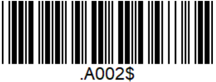
Enable scanning MSI barcodes

Enable all symbologies (ensures all supported codes can be scanned; to enable particular symbologies only, scan the appropriate codes from the user guide.